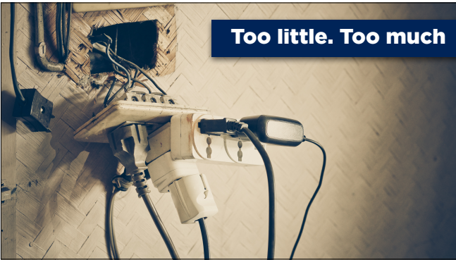
Too little. Too much